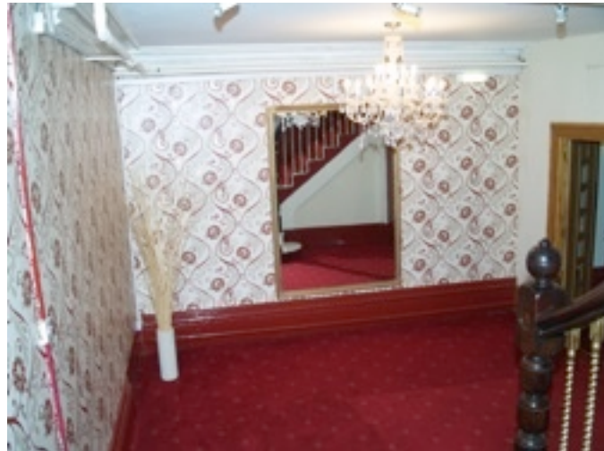
Left: The Regency Ballroom Above: The Main Entrance